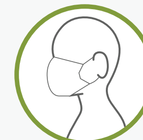
NO-SEW MASK USING A FOLDED SCARF/BANDANA AND RUBBER BANDS/HAIR TIES

For more information on non-medical masks or face coverings consult: https://www.canada.ca/en/public-health/services/diseases/2019-novel-coronavirus-infection/prevention-risks/about-non-medical-masks-face-coverings.html