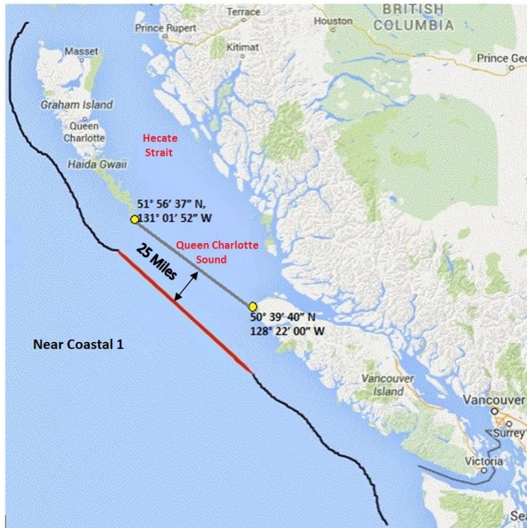
Map 2 – Domestic voyage limits on the Pacific coast