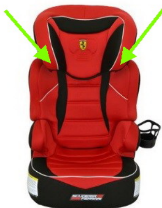
Figure 1. Location of the Shoulder Belt Guides

It is possible that the labels affixed to, and the English and French instruction manuals provided with the booster seats did not outline the proper shoulder belt guide configuration. Without the correct instructions, it may be possible to have the vehicle shoulder belt routed incorrectly, preventing the belt from sliding freely in the guide. The revised instructions clarify the correct routing of the vehicle shoulder belt through the shoulder belt guide. Transport Canada’s defect investigations program identified this issue after receiving a consumer complaint.