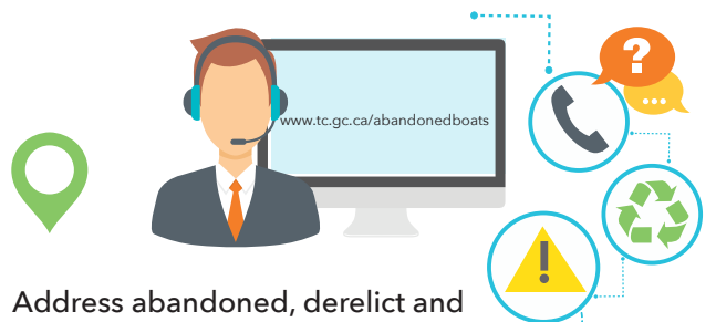
Address abandoned, derelict and wrecked vessels