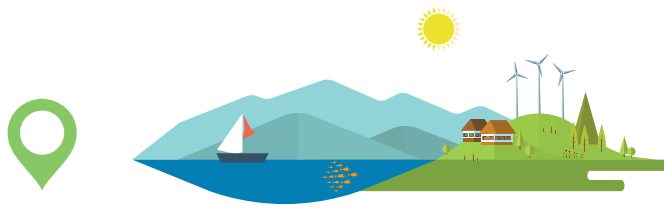
Restore coastal ecosystems