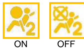
Figure 2 – Passenger Airbag Status Indicator

The airbag readiness light is not to be mistaken for the passenger airbag status indicator . A passenger airbag status indicator can be found on the instrument panel of vehicles equipped with a front, passenger-side sensing system. The status indicator will light up either the ON or OFF symbol to let you know the status of the right front passenger's frontal airbag (enabled or disabled). Please consult your owner's manual for details.