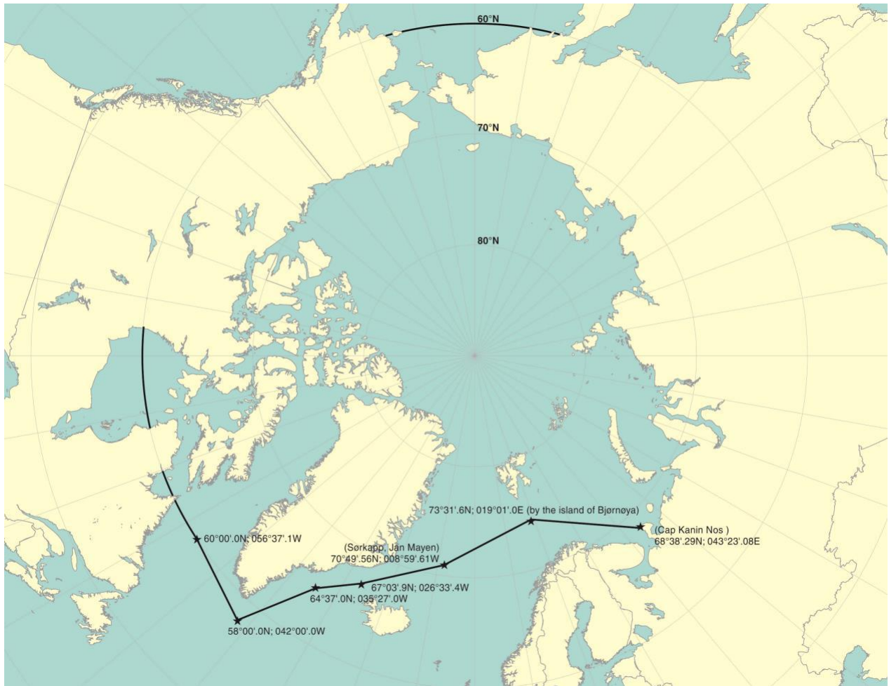
Figure 2 – Maximum extent of Arctic waters application