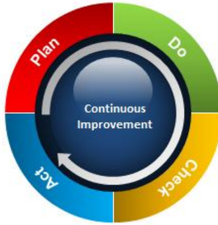
Figure 1 – Plan-Do-Check-Act and the IMS Standard